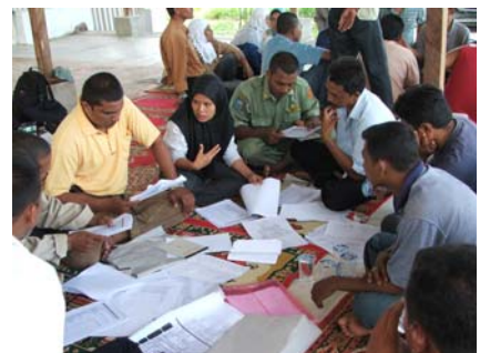
Community at work.