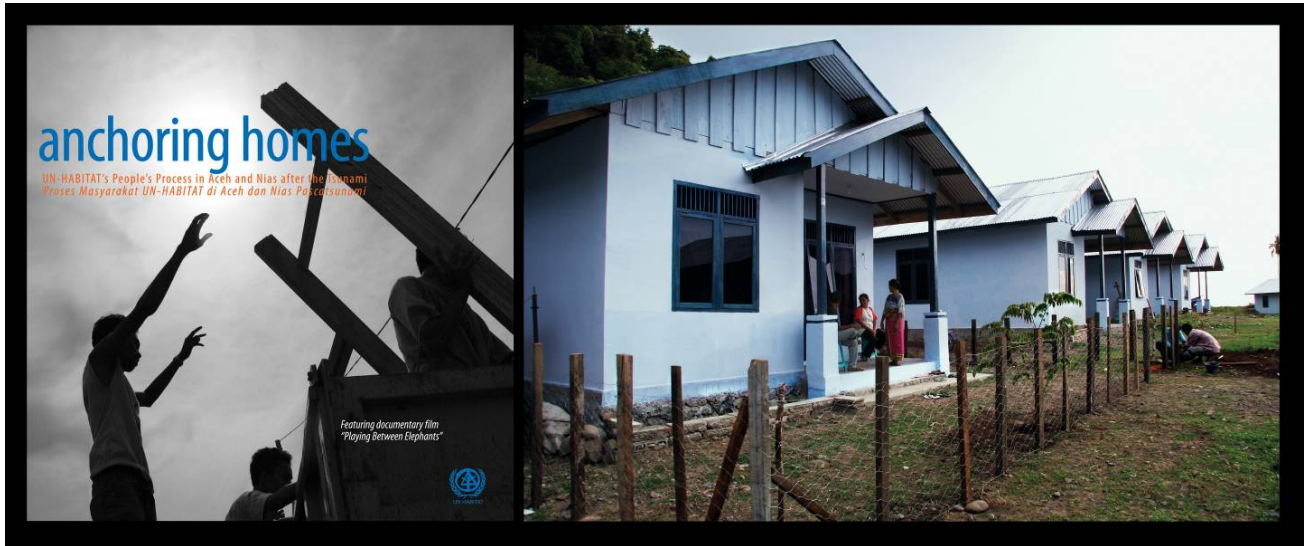
Photo book cover and photo book picture from the reconstructed village of Lampoh Raya, Aceh Besar

managers of their own recovery and children who overcome their post disaster trauma. All guests could also enjoy the pictures from the book, the work of young and talented Indonesian photographer Veronica Wiaya, in an exhibition. People who are interested in receiving the photo book can contact UN-HABITAT's office in Banda Aceh: diella[at]junhabitat-indonesia.org